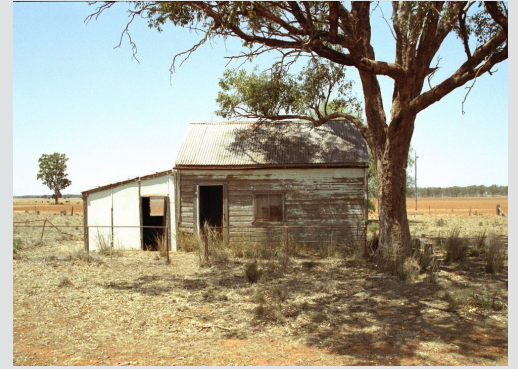
TONY'S PRIMARY SCHOOL

'Commercial success in life stems from self-discipline, perseverance and diligence. It is up to each of us to control how conscientious we are; how diligent we are; how persistent we are; and, importantly, how hard we work. These convictions have inspired me to write about my glorious ride from the family sheep station "Jumble Plains" in the far west of New South Wales to Eternity. The aim of my book is to motivate and encourage others to roll up their sleeves and have a go.'